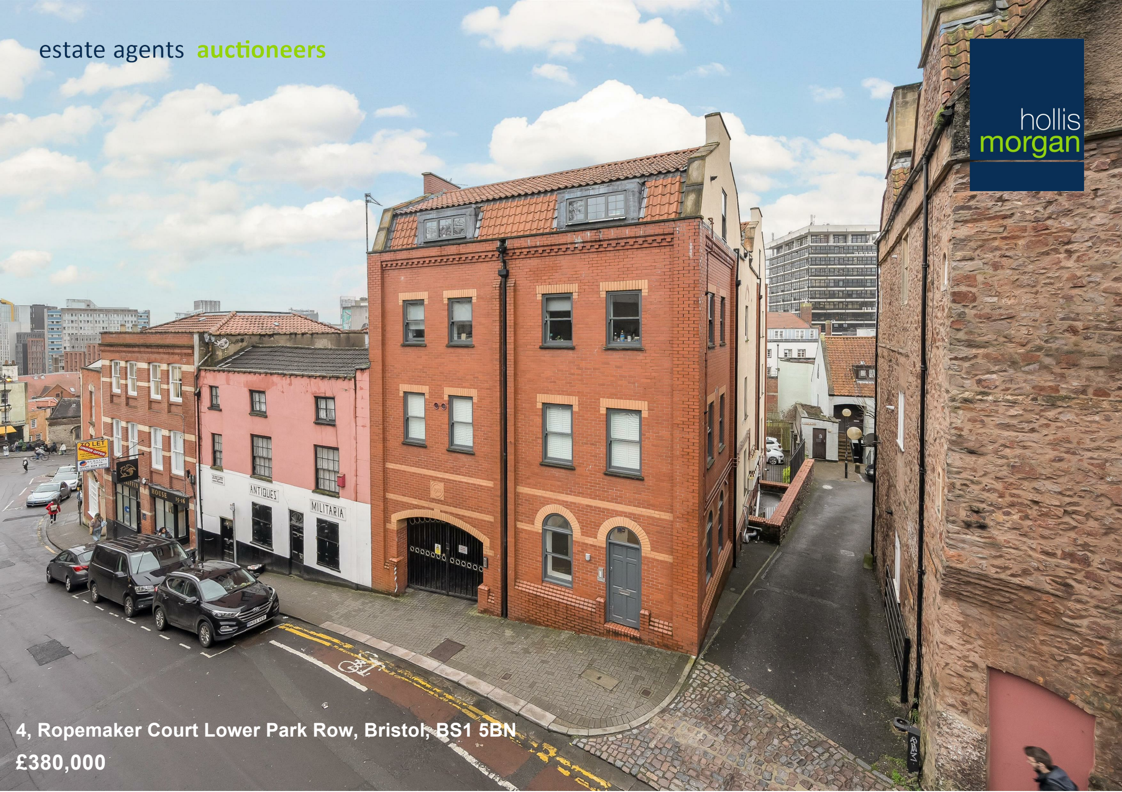
4, Ropemaker Court Lower Park Row, Bristol, BS1 5BN